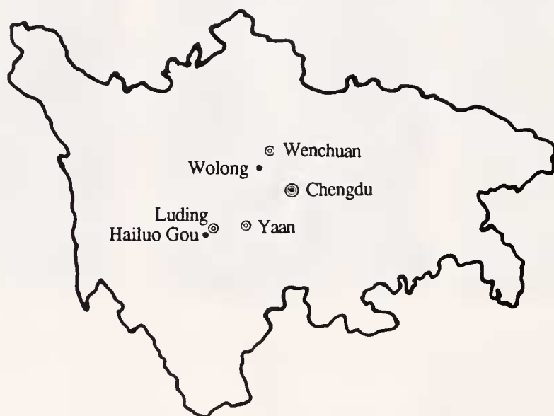
FIG. 2. Map of Sichuan showing approximate position of localities.